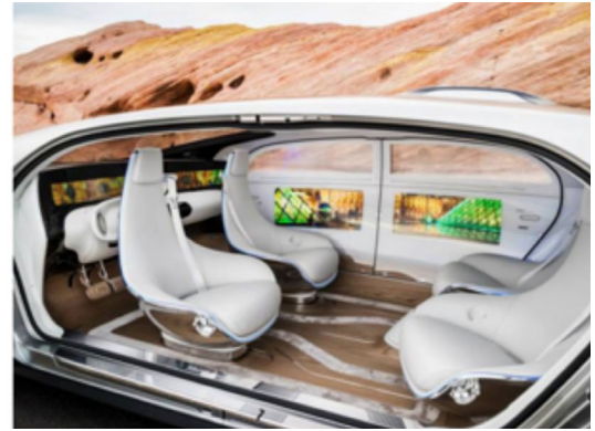
Figure 1: Then and now

If we think at the first car ever created probably, we have the image of Fred Flintstone driving his family and pets in a stone wheel open car. Then the movies with Charlie Chaplin appeared and some vehicles were present. Moving forward to the 80ies or 90ies, keyless entry systems, electric doors and windows, sunroofs, and CD players began to gain popularity and at the beginning they were seen like something related to high-end technology. And here we are, in the nowadays transportation industry with MP3 players, hard drives, USB ports, memory card slots, advanced safety systems, GPS, navigation screens, cruise control, braking assistance, and even the ability to parallel park themselves. Seems crazy, but it is true. In this age, cars come standard with features that were once a luxury (or did not even exist at all). It is amazing to think how far cars have come, and the technology keeps advancing. New concepts appear and the self-driving transportation technology becomes an emerging market at global level. The estimations, studies, or reports are showing a growing trend and numbers seem to get higher from year to year. Car market for partially autonomous-driving will be around $36 billion by 2025.