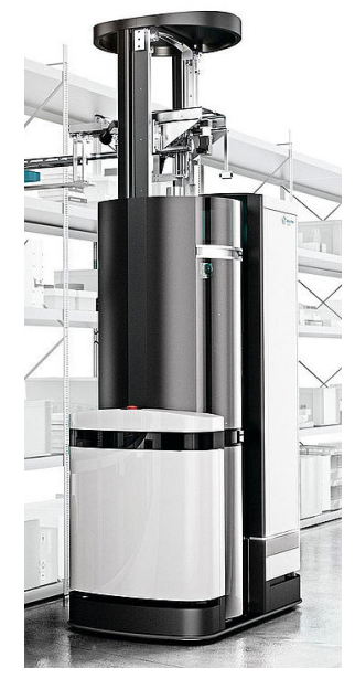
Figure 2: The Toru picker self-driving logistics robot from Magazino using CANopen motion controllers by Faulhaber is a typical example of a modern CANopen application

Besides the CiA 401 modular profile for 1/0 devices, the CiA 402 drives and motion control profile seems to be the most implemented one. The number of servo controllers and stepper motors supporting CiA 402 is huge. The CiA 402 specification gives the implementers some freedom to use manufacturer-specific functions. This leads to some interoperability issues, when integrating them with host controllers.