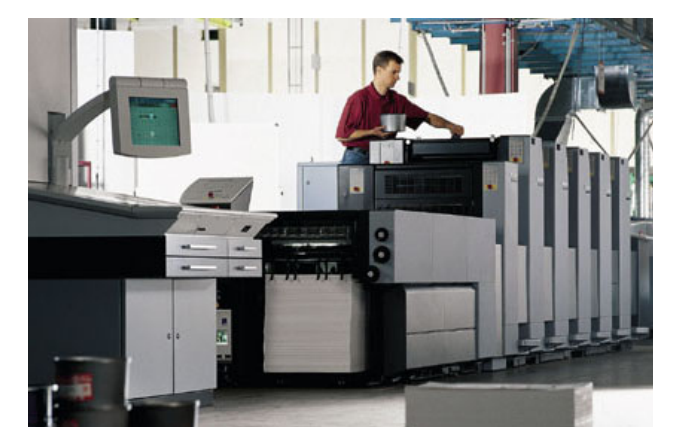
Figure 1: Heidelberg printing machines is one of the early users of CANopen as network to connect add-on devices to its Speedmaster machines

implemented. Upper testers depend on the device-undertest. This means they are unique and cannot be used easily to test other devices.