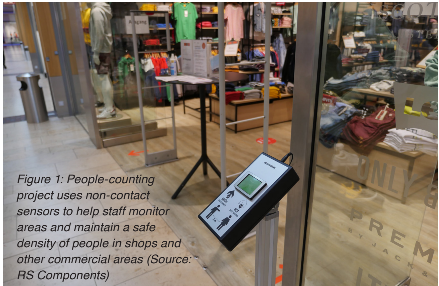
Figure 1: People-counting project uses non-contact sensors to help staff monitor areas and maintain a safe density of people in shops and other commercial areas

This feature ensures that no display programming is necessary. The DMA-15 can be fully integrated within the graphical Micon-L Software Suite supporting any Barth mini-PLC with CAN interface. With the open-source programming option the DMA-15 can be user-customized within the powerful Keil \mu Vision software suite. Several