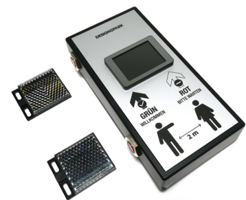
Figure 2: A password-protected CAN touchscreen is used to preset the maximum person limit ▷

As already mentioned, the CAN display can be directly connected to any Barth mini-PLC providing a CAN interface. In case of the People Counter project, it is connected to the STG-800 PLC. The controller comes with a 32-bit ARM Cortex core and features a rugged CAN/CANopen/J1939/NMEA 2000 interface with intuitive graphical programming capability. The Cortex core provides two high speed event, pulse and frequency counter inputs and one 16-bit PWM output combined with a internal voltage reference for the 12-bit analog inputs. The CAN/CANopen/J1939/NMEA 2000 interface is able to operate in noisy environment and allows the user to connect a variety of network com-