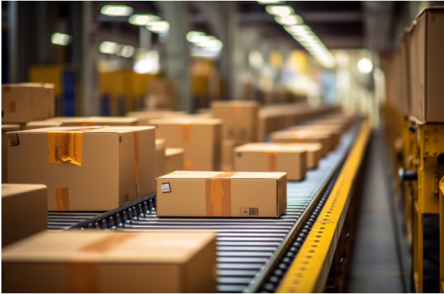
Figure 1: Parcel sorting machine

minor customization for the mechanical elements, complemented by a new electronic control system developed from scratch. The Delta Line solution offered enhanced performance compared with its predecessor, allowing the sorter to work with packages up to 50 kg, whereas the previous limit had been between 35 and 40 kg. The customer appreciated the high level of technical expertise that the Delta Line engineers could bring to the project and also the company's competitive pricing.