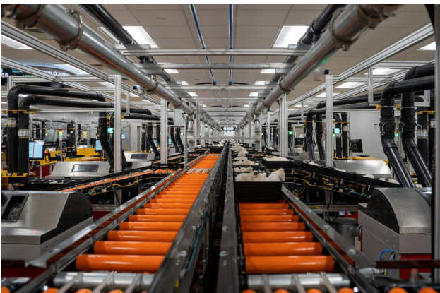
Figure 2: Conveyor system

Conveyor system: This project was for a new application for which Delta Line developed a fully customized solution based on two sizes of stepper motor, complete with brakes and an electronic control system. As an initial step, Delta Line supplied the customer with separate components so that the design approach could be checked