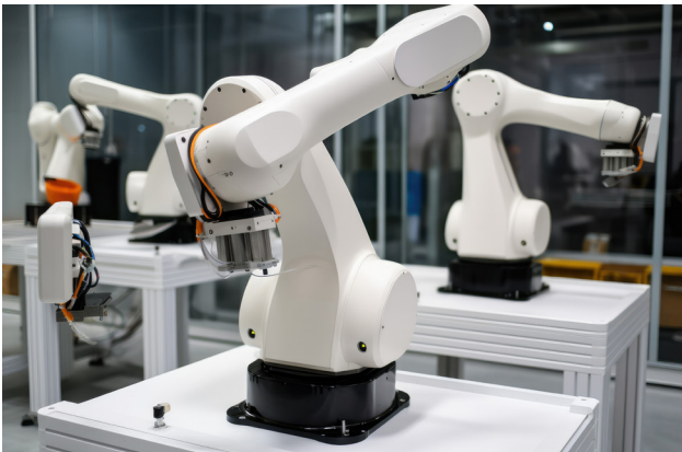
Figure 3: Delta Line provides standardized and customized motion control systems for robotics applications

The main challenge faced by robotic system designers is the need to fit more and more into a limited space e.g. in prosthetics and industrial robot applications. The company offers (frameless) motors, with high power density suited for compact yet powerful motion solutions. Typical robotics applications also require smooth motion, with minimal cogging or torque ripple and feedback from devices such as absolute shaft encoders, to enable precise positioning. Such solutions involve complete systems including the drive electronics, feedback devices and, in some cases, a gear train. Delta Line helps to select and realize the right motion system solution for a particular robotic application. The standard or customized solutions are optimized in terms of performance, reliability, longevity, size, and cost.