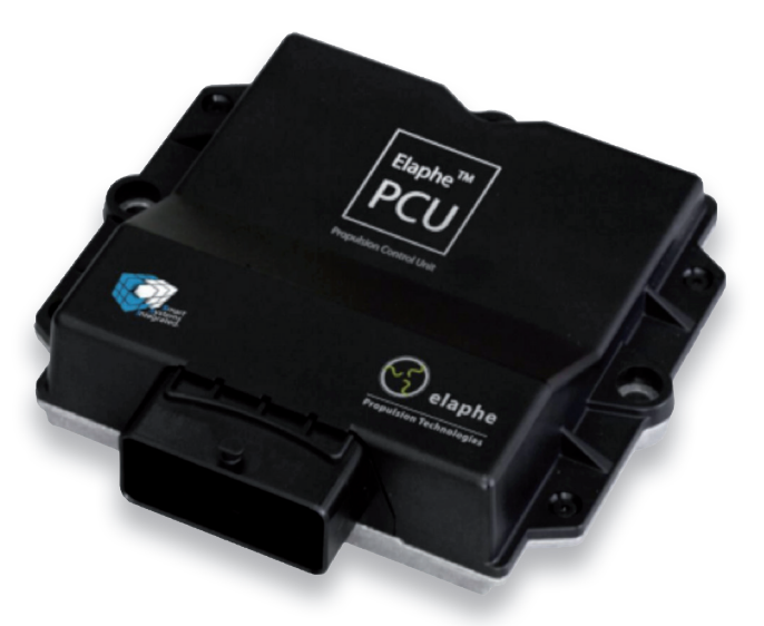
Figure 1: The automotive-grade ASIL-D-rated PCU 2.0 enables use of four separate CAN networks and supports Flexray; As an ECU, it is compatible for use on many different levels of control within a vehicle – including serving as a powertrain controller for autonomous applications built on top of the stack

From a future market standpoint, the powertrain will need to become invisible to the user as much as possible, and the software will likely be the main differentiator.