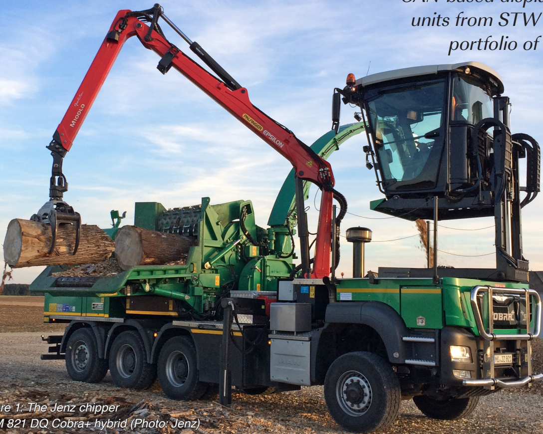
Figure 1: The Jenz chipper HEM 821 DQ Cobra+ hybrid

Jenz introduced new CAN-based display control units from STW into their portfolio of chippers.