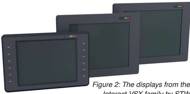
Figure 2: The displays from the Interact-VSX family by STW

using various display instruments. The level of brightness also permits good legibility in direct sunlight. Regarding the presentation, the operator also profits from the performance capability of the display. Menu changes take place spontaneously; the display instruments run jerk-free so that pleasant operation with immediate feedback is possible.