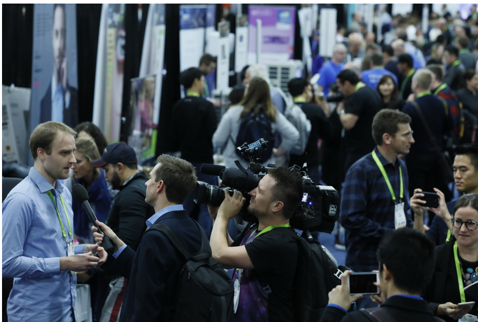
Figure 2: CES 2018 – 51 years later, the exhibition is spread out in entire Las Vegas including hundreds of private events

for the shallow visitor. You needed to dig a little bit deeper to find the CAN-based embedded networks on the exhibition in Las Vegas.