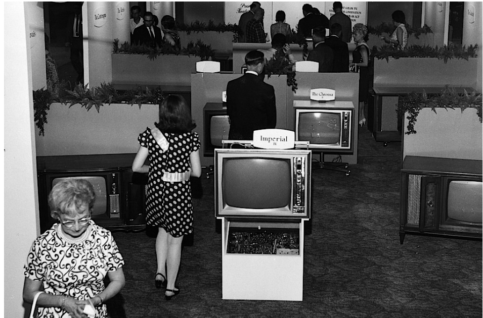
Figure 1: CES 1967 – 51 years ago, the show started in New York City

the end, you always have to communicate reliable and robust just a few bits and bytes. CAN is a very proven network technology for such tasks. But it was nearly invisible