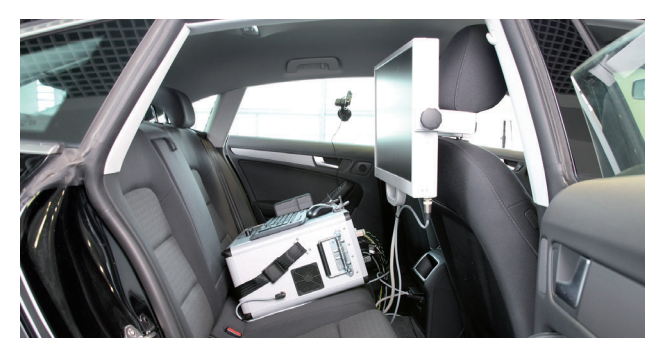
Figure 2: The VTK is put on the back-seats and linked to the CAN-based in-vehicle networks

various perspectives using the measuring and analysis software D-Lab.