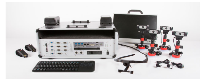
Figure 1: The VTK comprises several hardware components and the D-Lab software platform

Ergoneers specializes in the development of hardware and software for behavioral research. The company has therefore developed the Vehicle Testing Kit (VTK), which features several hardware components and provides the modular D-Lab software platform to facilitate the execution of real-world driving studies. This specially designed tool minimizes work during real-world vehicle studies: So far, an enormous effort has been required in terms of technology, time and thus finances, to install the entire test equipment for test series in a suitable vehicle. VTK provides a cost-effective solution: It is portable, easy to manage, and can be integrated effectively into various vehicles. Data are then structured and systematically collected, and can then be evaluated from D