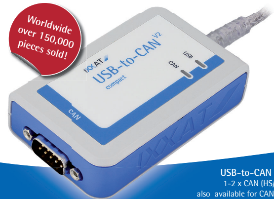
USB-to-CAN V2 1-2 x CAN (HS/LS) also available for CAN FD