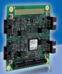
CAN-IB 130/PCIe 104 2-4 x CAN (HS) CAN FD available