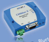
CANblue II - Bluetooth PC interface, bridge, gateway 1 x CAN (HS)

HMS Industrial Networks GmbH Emmy-Noether-Str. 17 · 76131 Karlsruhe