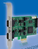
CAN-IB 100/200/PCIe 1-4 x CAN (HS/LS) CAN FD available